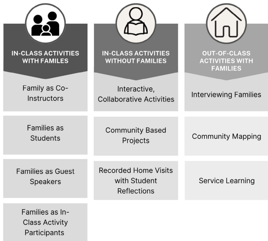
FIGURE 1: Activities to Support Relational FCPs and FPPs in Preservice Teacher Coursework

the practices that make up the relational component of FCPs are of particular interest. Relational FCPs include practices that build positive relationships with families, such as active listening, compassion, empathy, respect, and taking a nonjudgmental stance (Dunst et al., 2002). Additionally, components of relational FCPs include positive beliefs and attitudes about families, especially views that pertain to parenting capabilities and competencies (Dunst, 2002).