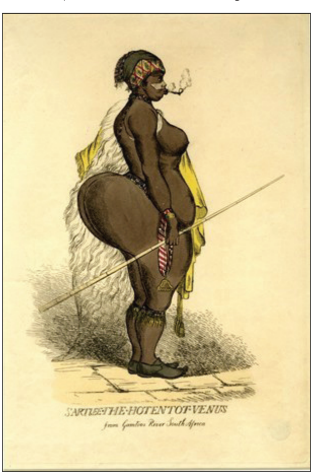
Portrait of Saartjie Baartman, naked

Perhaps the most famous story involving the human zoo is that of Saartjie Baartman. Baartman's story describes the life of an indigenous woman captured for display in a human zoo. Baart-