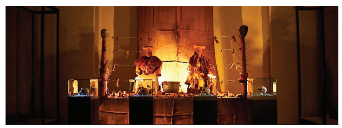
Civilizing the Natives: Herero prisoners cleaning Herero skulls for European museums © Brett Bailey

in a small area, fenced off by barbed wire. A large cooking pot sits upon a stack of wood between the women. Hanging from the barbed wire are what look to be pieces of flesh. The entire display is placed behind four pedestals, and on these pedestals are four skulls enclosed in glass cases. A backlight causes the faces of the women to be lost in shadows—the darkness of the exhibit further dimming their already dark skin. Spotlights draw attention to the hands of the actresses, causing the audience to focus on the actions taking place, as described by the plaque.