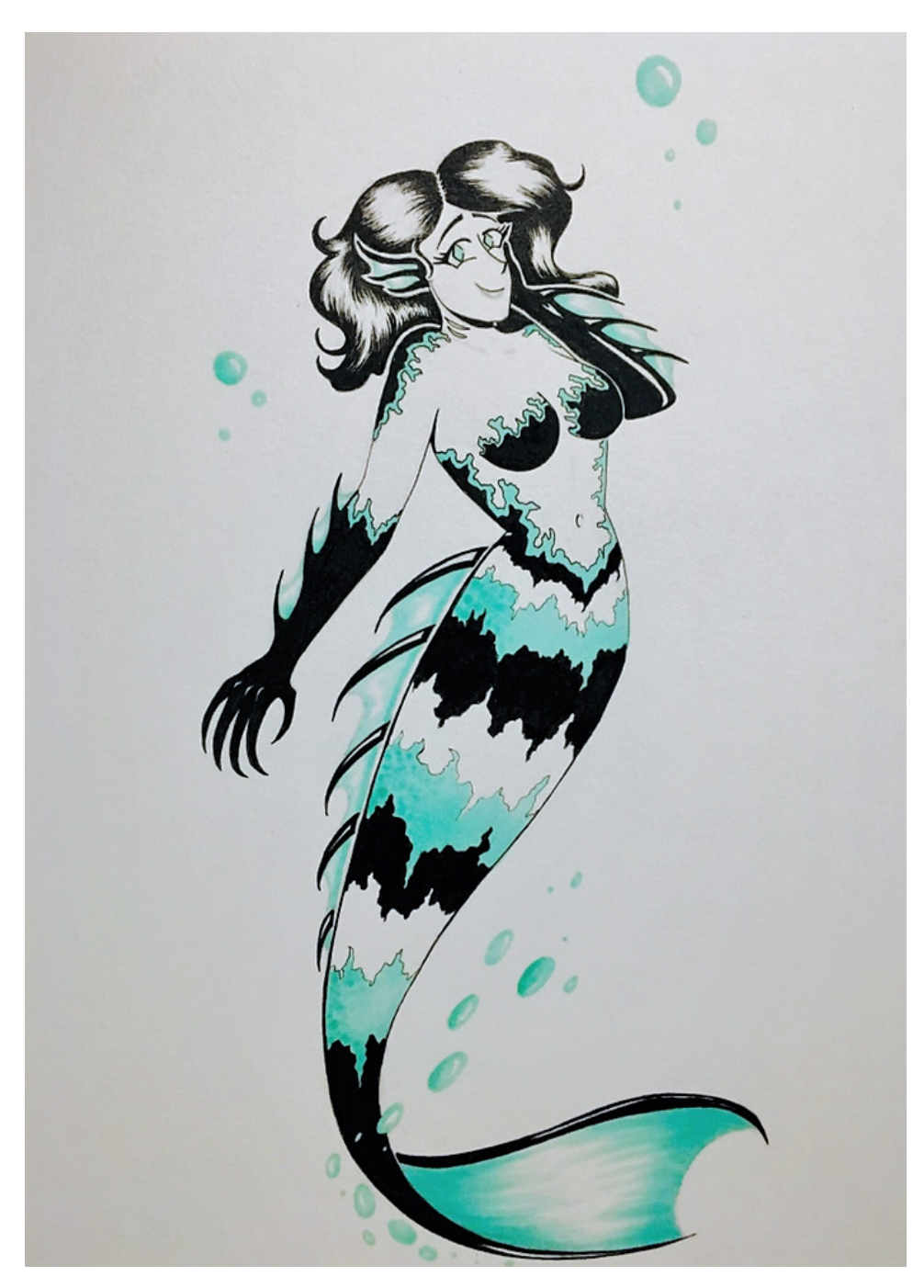
The Modern Siren, 2018, Ink, graphite, and marker, 9 in x 12 in.

The Modern Siren also takes similar inspiration to the jellyfish's themes. In Greek mythology, sirens were bird-women who enchanted sailors with their songs and drove ships into rocks, but over time sirens were conflated with mermaids into their modern incarnations. I like to think of utopias as modern sirens. Utopia is alluring, and many characters in literature and film want/try to achieve it, but often utopias are warped by human flaws into monstrous, corrupt dystopias. It is easy to stare at the siren's beautiful face, listen to her enchanting voice, but her more sinister features should not be ignored. Utopia also means "no place," which I also related to my siren, since it is a creature that does not