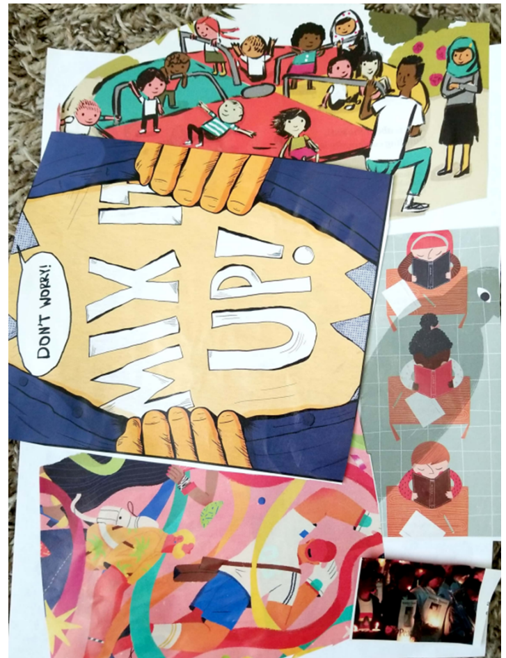
Figure 3. Fay's Collage

I tried to stay very true to the [directions for making the] collage and not really think about it a whole lot, and just really grab things quickly. And as somebody who really likes to plan and think everything through, it was a lot. It was kind of anxiety-inducing, but it was also very freeing.