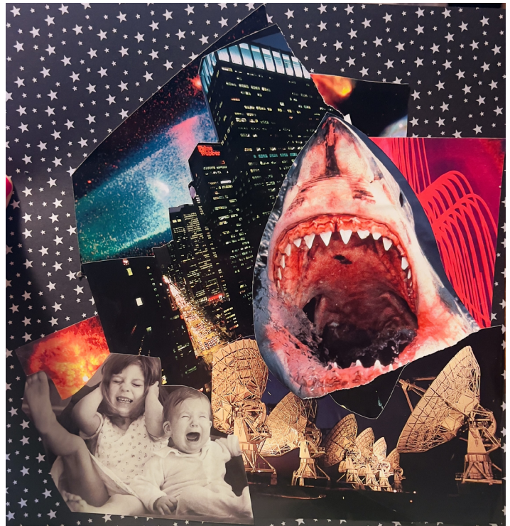
Figure 5. Irene’s Collage

If school counselors are committed to abolition, their visioning must shift beyond singular, individualized processes. This study focused on how organizers and school counselors came together to vision abolition in school counseling, documenting their processes of visioning and the visions themselves. Our findings indicated that not only did collective visioning contribute to richer, more contextualized visions, but the relational process of prefiguring a more liberatory approach to our work produced a “productive tension” that the partners in this project felt deepened and provocatively shaped their experience together (Davis et al., 2022).