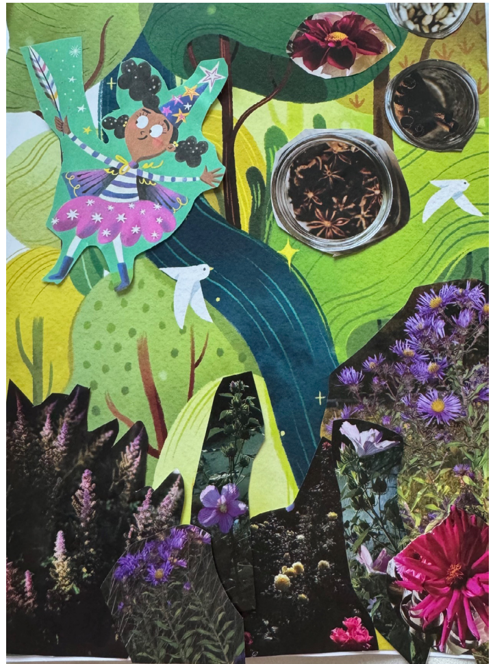
Figure 1. Amber's Collage

Here, Emelia described the need for educational spaces to be broad and open enough to accommodate all the differences that students and their communities bring to school. Describing the need for opportunities for students to be whole, rather than denying their social, cultural, and political identities, Emelia rejected the common practice of forced assimilation in schools, an element of soft policing (Kaba & Ritchie, 2022). Rather than a container with a firmly sealed lid, Emelia emphasized the need for schools to be flexible spaces that adapt to