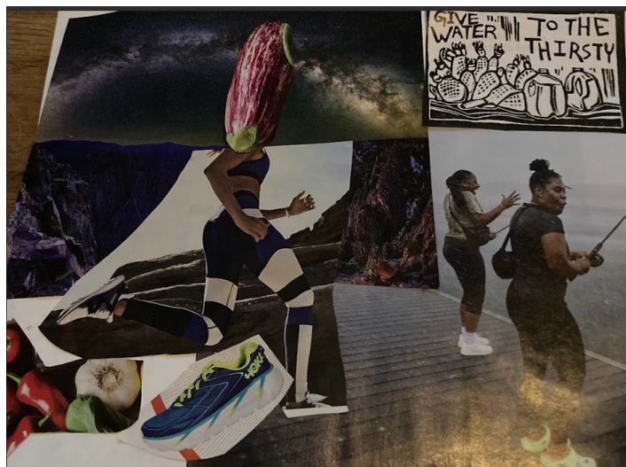
Figure 2. Lex's Collage

Pushing outside of just the school walls and making a connection in my community is an example of really living that out [experimentation], trying to create something that expands beyond school to benefit the community.